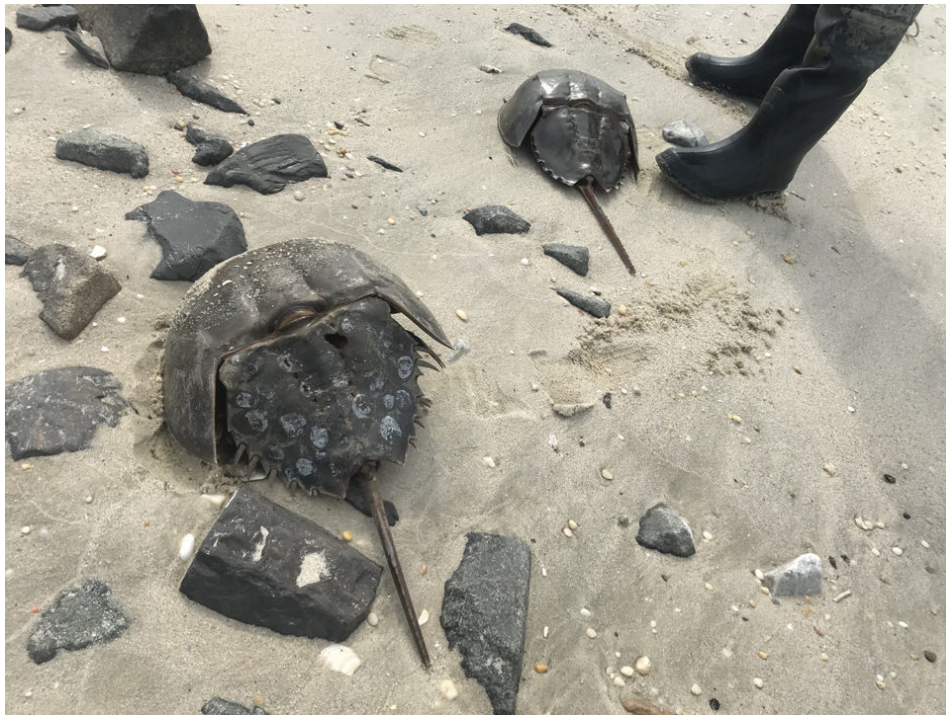
Dead horseshoe crabs on the beach in Delaware Bay.